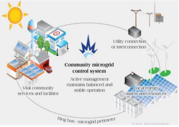
Fig.1 Microgrids Combine Various Distributed Energy Resources (DER)

Microgrids combine numerous distributed energy resources (DER) to form an entire system that's larger than its parts.